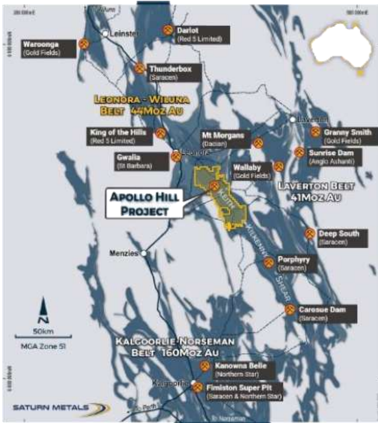
FIGURE 1: APOLLO HILL GOLD PROJECT